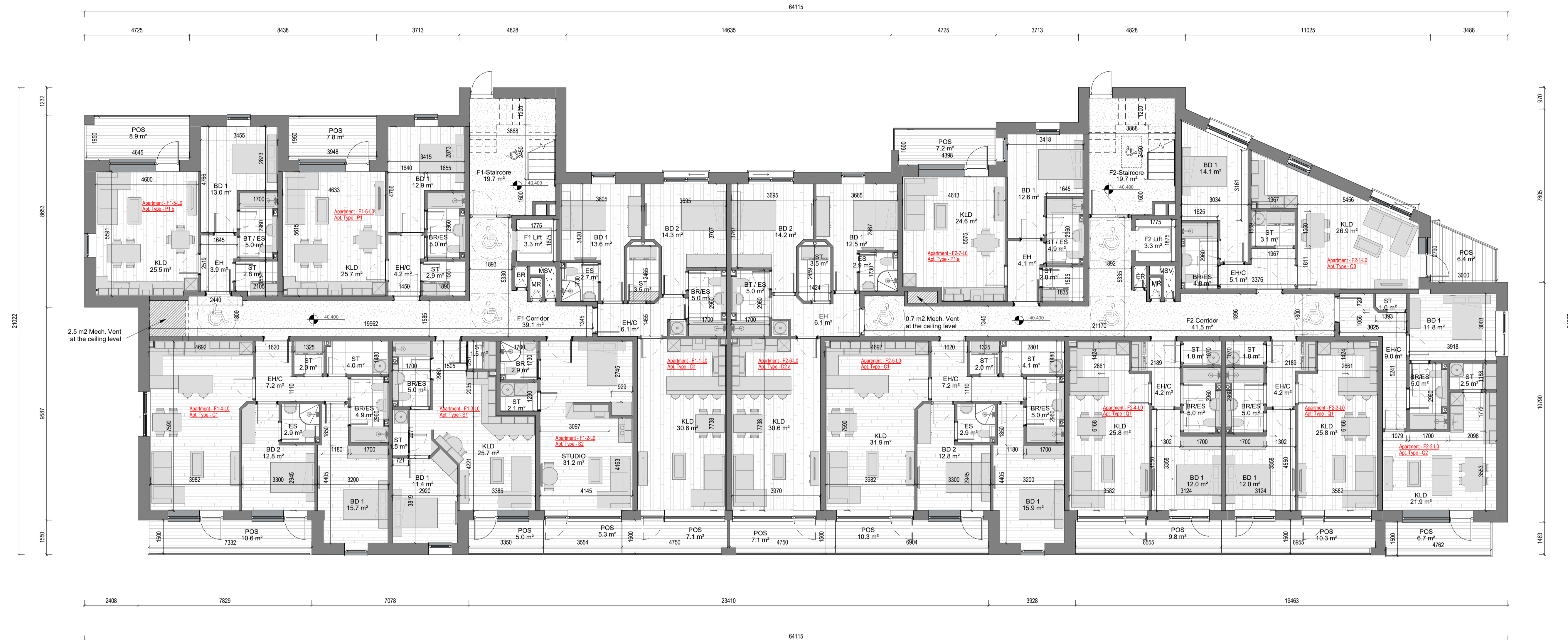
1 GA - Ground Floor Plan 1 : 100